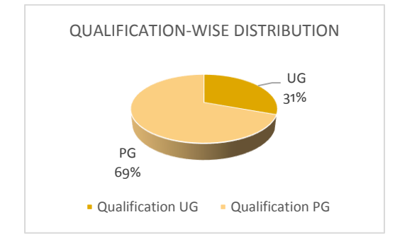
Graph-iii UG and PG Teacher Trainees