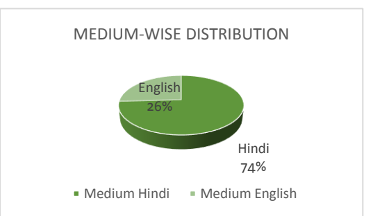
Graph-iv English Medium and Hindi Medium Teacher Trainees